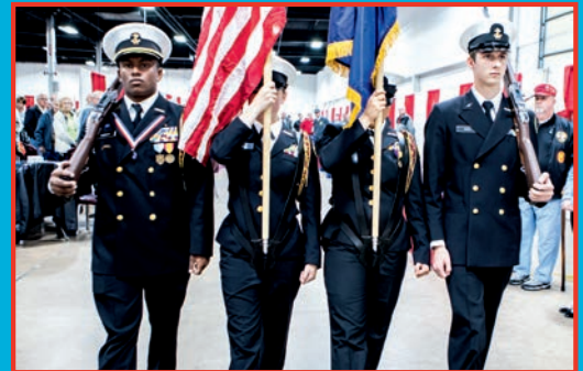
Thank you to the Owen J. Roberts High School Naval Junior Reserve Officer Training Corp.

On November 7, the SD44 Team hosted our first Veterans Expo! We would like to thank our partners at the Pennsylvania Department of Military and Veterans Affairs, the Disabled American Veterans Norristown Chapter 25, and all of the vendors and service organizations who participated in providing informative and helpful resources to our veterans.